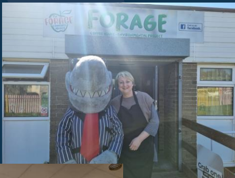
At the HALO project and The Forage Community Project in Sunderland