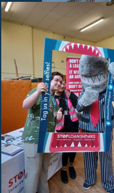
At a partner event in Dudley