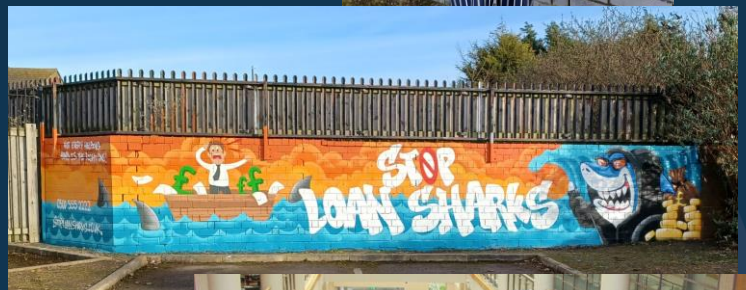
With staff and students at South Devon College